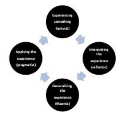
Figure 2.2 Learning Styles (Honey and Mumford)

This model can be used to show that people vary in their preferred style of learning (Honey and Mumford, 1992). It implies that people generally show tendencies towards one particular learning style, that of either the activist, reflector, theorist or pragmatist. It is based on Kolb's learning cycle and so the 'activist' is associated with 'experiencing something', the 'reflector' with 'interpreting the experience' and so on.